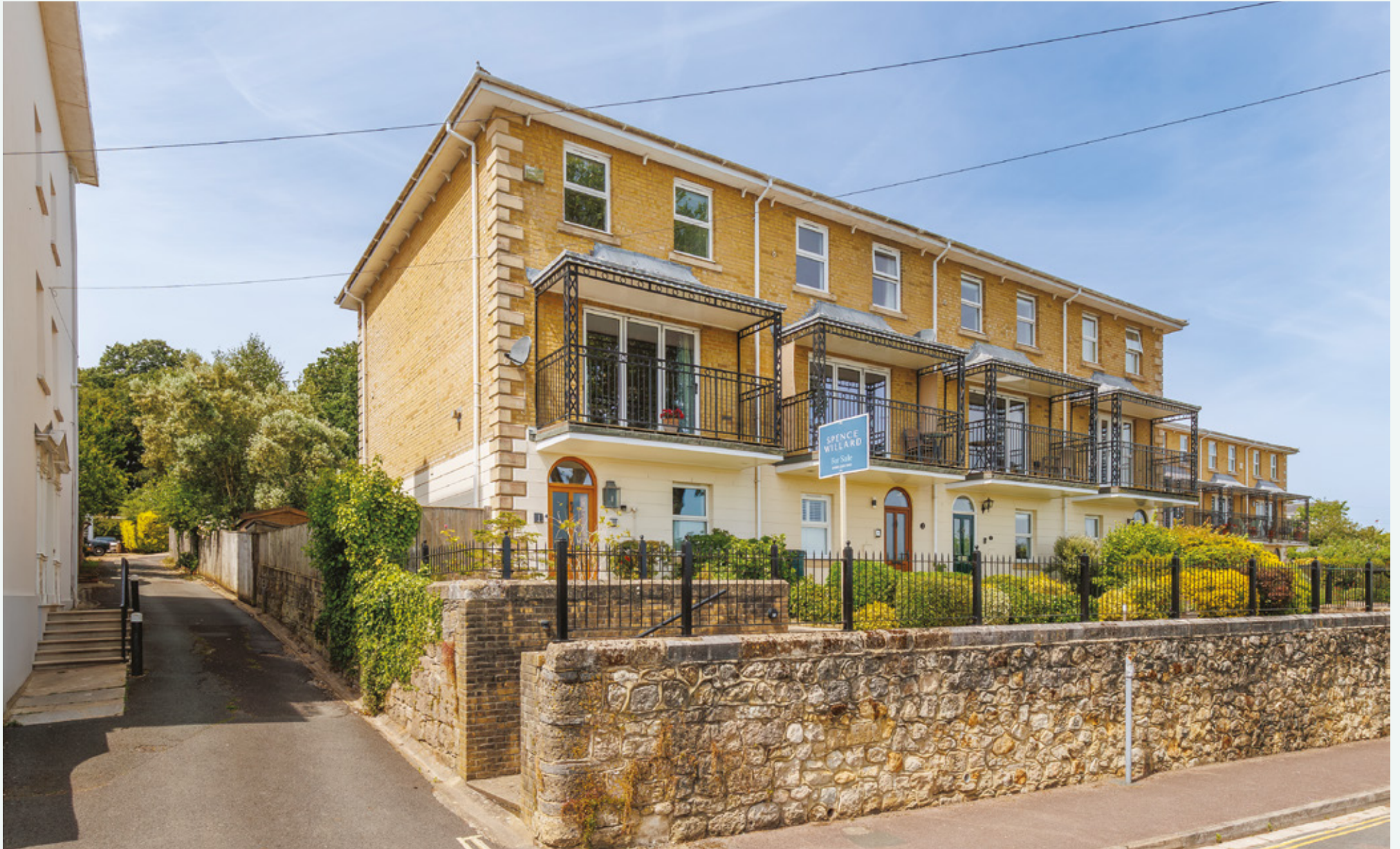
1 Langtry Place, Castle Road, Cowes, Isle of Wight